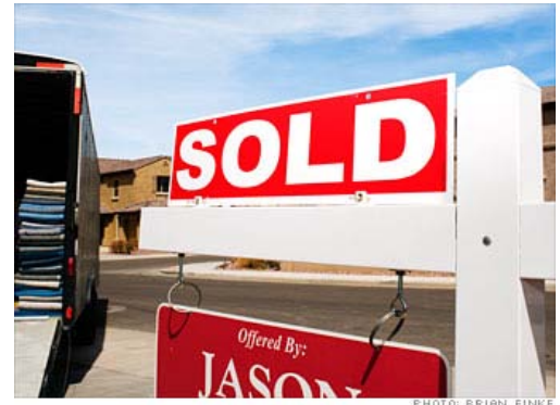
A home off the market in Mesa, Ariz.

The true disaster areas for housing since the bubble burst have been Sunbelt cities such as Las Vegas, Phoenix, and Miami -- places that boasted great job and population growth in the mid-2000s, only to suffer a housing crash that swamped them with empty homes and condos and crushed their economies. But people always want to live in those sunny locales, and their job markets are starting to recover, albeit slowly. In foreclosure markets the inventory problem is far greater because it includes not just traditional resale homes but millions of distressed properties. Fortunately those houses are now such a screaming deal that investors, including lots of mom-and-pop buyers, are purchasing them at a rapid pace. To be sure, some foreclosure markets won't rebound for years because they're both vastly overbuilt and far from big job centers; a prime example is California's Inland Empire, a real estate disaster zone 80 miles east of Los Angeles.